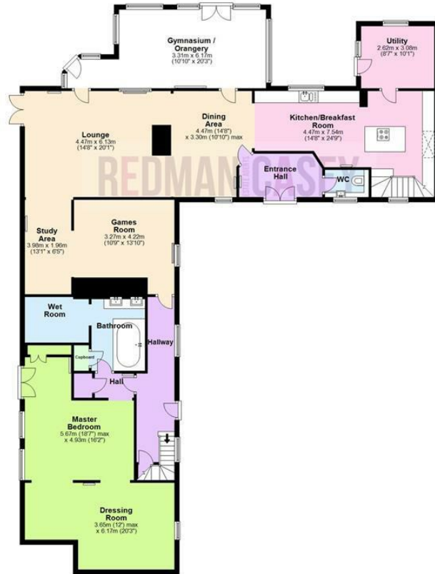
First Floor Approx. 100.9 sq. metres (1088.1 sq. feet)