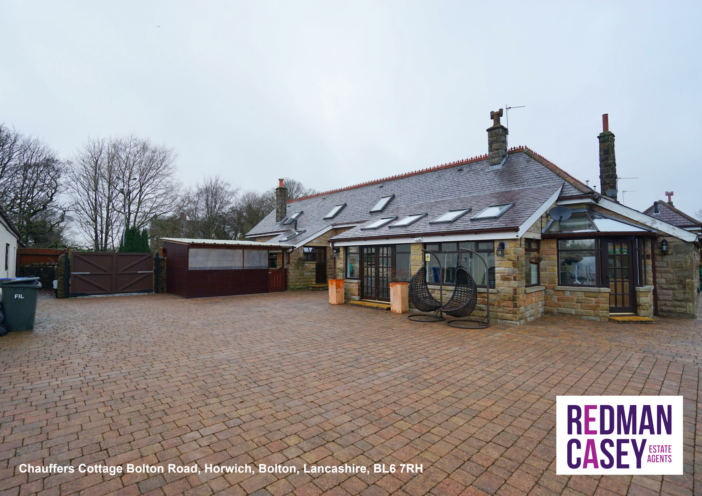
Chauffers Cottage Bolton Road, Horwich, Bolton, Lancashire, BL6 7RH